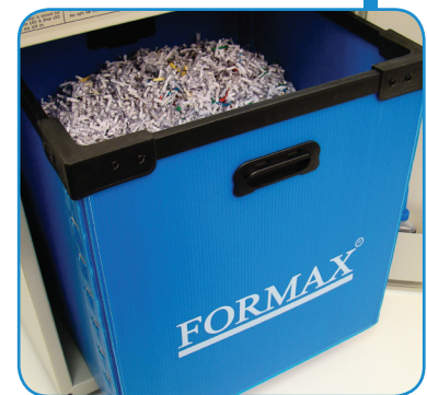
Lifetime Guaranteed Heavy-Duty Waste Bin